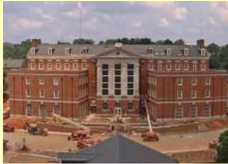
The new Brock School of Business building nears completion.

The Brock School will have a new home when classes begin on August 17 th . The Business building will provide a state-of-the-art facility for research, teaching, and community events. A grand opening celebration is scheduled for September 4 th from 1:00 to 3:00 p.m. and will be one of the events for Birmingham Innovation Week 2015. Everyone is invited to attend.