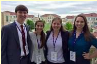
Brock School students at TCU